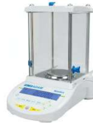
► WEIGHING SCALES