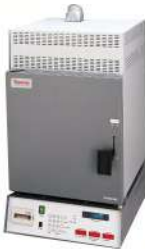
▶ ASPHALT IGNITION FURNACES