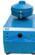
▶ ASPHALT CENTRIFUGE EXTRACTORS