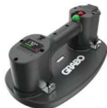
► ELECTRIC SUCTION CUP