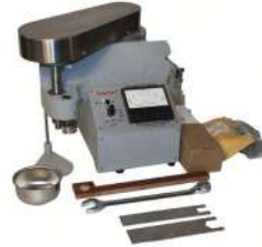
► LUBICITY METER