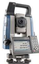
▶ ROBOTIC TOTAL STATION