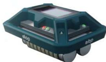
► ULTRASONIC CONCRETE SCANNER