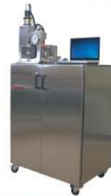
► CEMENT ANALYZER