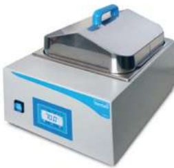
► WATER BATH