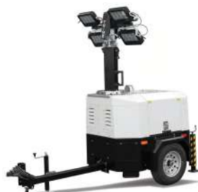
► TOWER LIGHTS