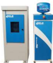
► CONCRETE COMPRESSION MACHINE