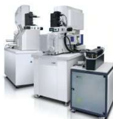
► RISE - RAMAN-SEM MICROSCOPES