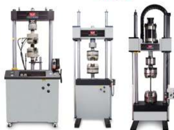
► DYNAMIC & FATIGUE TESTING SYSTEMS