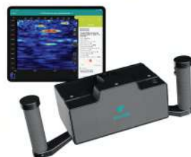
► ULTRASONIC PULSE VELOCITY