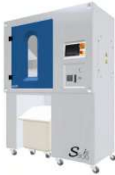
► CYCLIC CORROSION CABINET