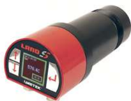
► NON CONTACT PYROMETERS