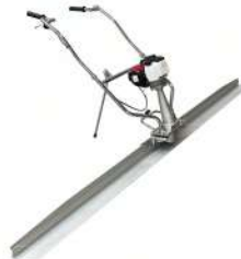
► POWER SCREEDS