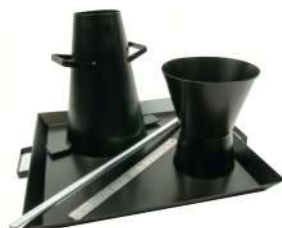
► SLUMP CONE