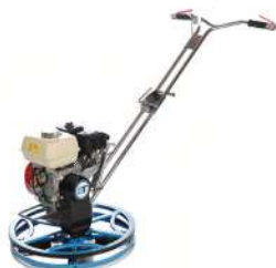
► POWER TROWELS