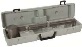
► MUD BALANCE