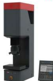
► HARDNESS TESTING