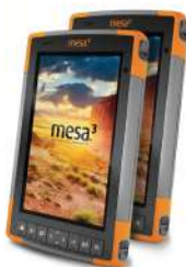
▶ DATA COLLECTORS