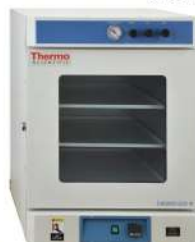
► VACCUM OVEN