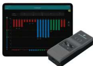
► PROFOMETER & COVER METER