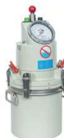
► PRECISION AIR ENTRAINMENT METER