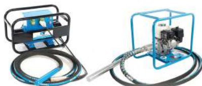
► POKERS AND VIBRATORS