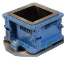
► MOULDING EQUIPMENT