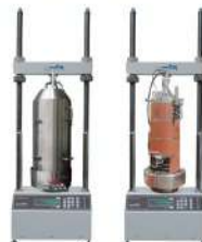
► STATIC TRIAXIAL TESTING