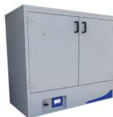
► SOIL OVEN