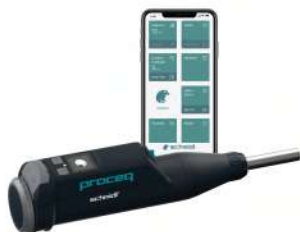
► REBOUND HAMMER