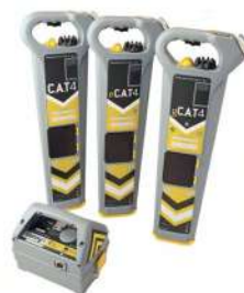
CABLE AVOIDANCE TOOL