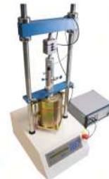
▶ MARSHALL TESTING MACHINE