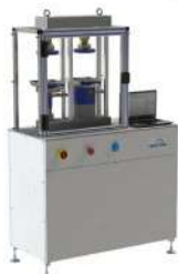
► COMPRESSION / FLEXURE TESTING MACHINE