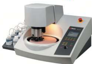
► METALLURGICAL SAMPLE PREPARATION