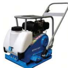
► PLATE COMPACTOR