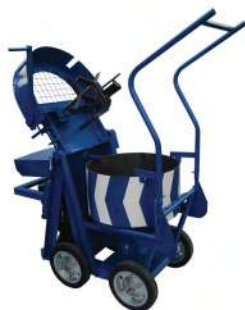
► CONCRETE PAN MIXER