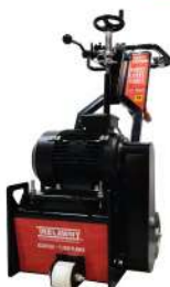
▶ FLOOR SCARIFIER