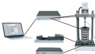
► DYNAMIC TRIAXIAL TESTING