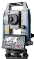
▶ ENTRY LEVEL TOTAL STATION