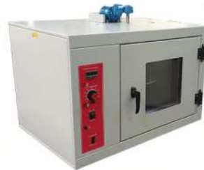
► THIN FILM OVEN