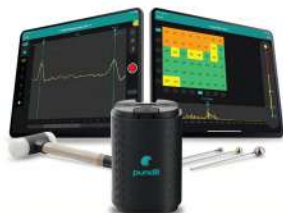
► PILE INTEGRITY + IMPACT ECHO