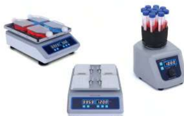
► ROTATORS, SHAKERS AND MIXERS