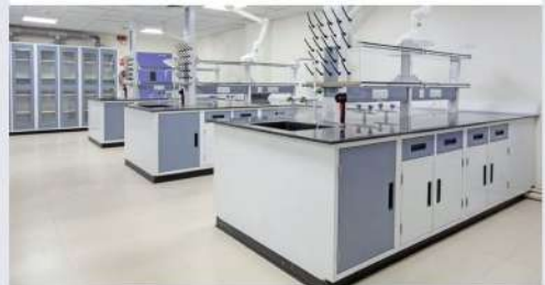
► LAB FURNITURE