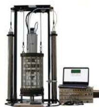
► RESONANT COLUMN