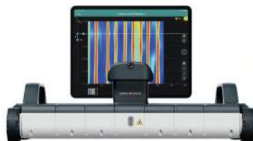
► GROUND PENETRATING RADAR