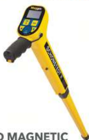
METAL AND MAGNETIC LOCATORS