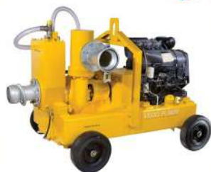
► DE-WATERING PUMPS