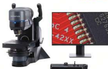
► DIGITAL MICROSCOPES