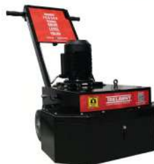
▶ FLOOR GRINDER-DUAL DISC