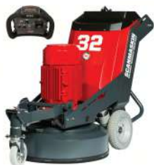
▶ PLANETARY CONCRETE FLOOR GRINDERS