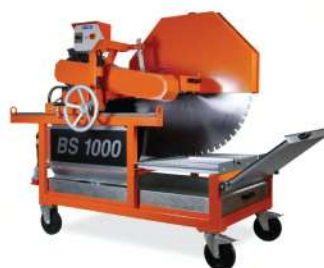
► MASONRY SAW