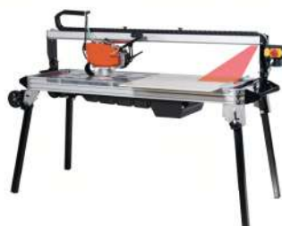
► TILE SAW