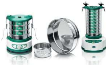
► SIEVES & SIEVE SHAKER