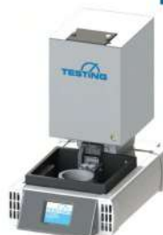
► AUTOMATIC VICAT NEEDLE APPARATUS