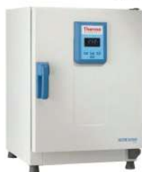
► HOT AIR OVEN