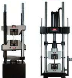
► UNIVERSAL TESTING MACHINES