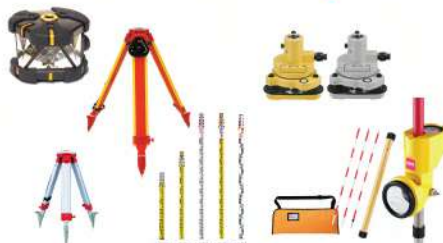
▶ SURVEYING ACCESSORIES