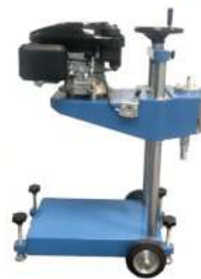
▶ CORE DRILLING