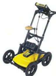
GROUND PENETRATING RADAR