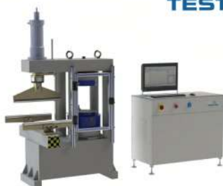
► COMPRESSION/ FLEXURAL TESTING MACHINE