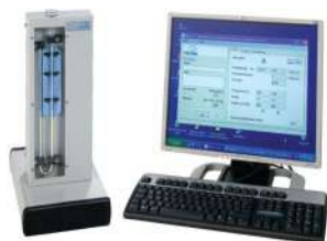
► FULLY AUTOMATIC BLAINE APPARATUS