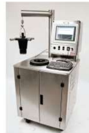
► HPHT CONSISTOMETER